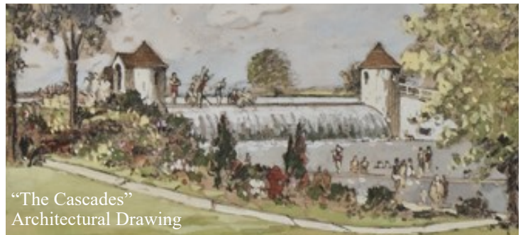
"The Cascades" Architectural Drawing

The public is invited to share photographs, documents, and stories related to this historic area. The authors are seeking an image of the Cascade Dam illuminated with lights. Do you have this elusive photograph?